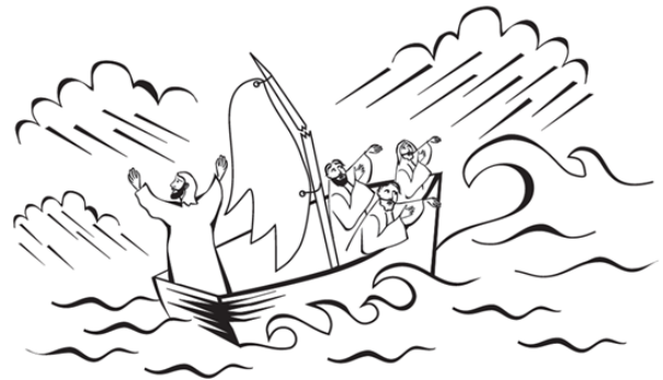
Even the wind and the sea obey him. (Mark 4:41)

Lord God, Jesus' disciples were alarmed and woke Jesus up. That was good, but it would have been better to trust him in the midst of the storm. There was only one cushion in the boat, and that was for the steersman. Jesus had his head down on it. Lord Jesus, may we trust you as our leader even when you seem to us to be asleep at the helm. Amen